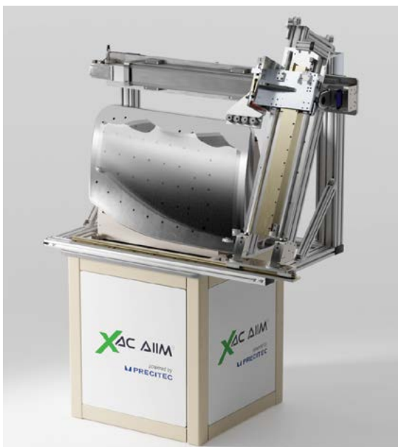
XacAIM scanning system for multiple automotive glasses.

To overcome this problem, Xactools and Precitec developed a dynamic scanning system with three