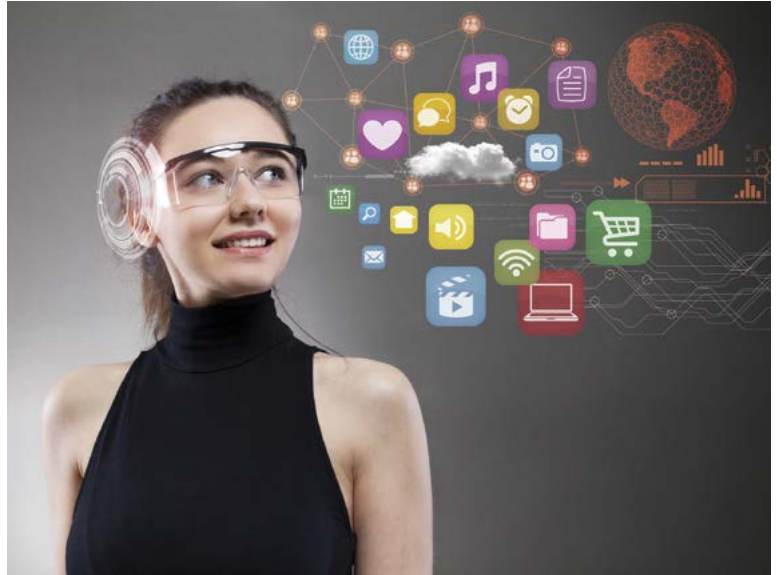
Precise measurement of the multiple layers is crucial for an extremely high degree of accuracy for laminated glasses.

Because the materials used in these multi-layer laminated glass applications are mostly optimised for specific wavelength ranges, however, they are often non-transmissive to infrared light. So, the optical measuring technologies commonly used in inspection processes are no use in these multi-layer applications. Moreover, differences in the refractive indices of the various materials are very small, as the materials used have to be index-matched to ensure correct imaging. Add to this the often highly expansive nature of the materials (eg the chemical components of the plastics or the index-